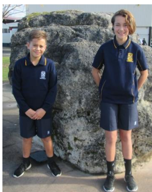
YEARS 7 - 10