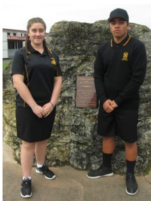
YEARS 11 & 12