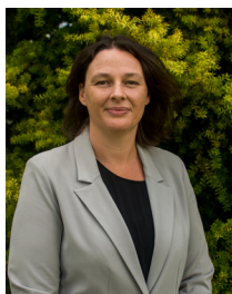
Tēnā Koutou Katoa

Term 4 is a very busy term with seniors preparing for their external examinations, completing internal assessments, prizegiving, reporting, prefect selection for 2019 and the list goes on. We have wonderful students at the College who have excelled in their learning, sport, service and leadership. We will recognise these achievements at our senior prizegiving.