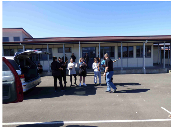
Wairoa College students taking part in the NZ Firearms Safety Certificate Course