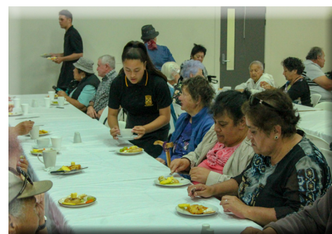
Students catering morning tea at Kaumatua Day