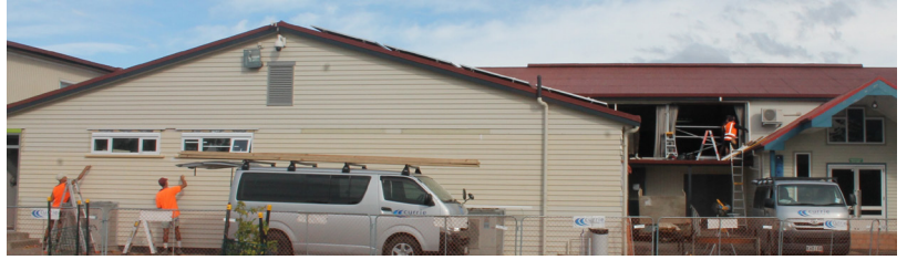
Library renovations under way